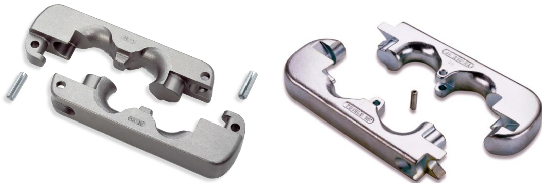
Figure 1: Standard version and Central Pin version (CP)

Depending on the type of connector, the two connector halves are secured against accidental opening, either by a central pair of pins (Figures 1 and 4; name extension "CP" = central pin) or by two pairs of pins, one placed at each end.