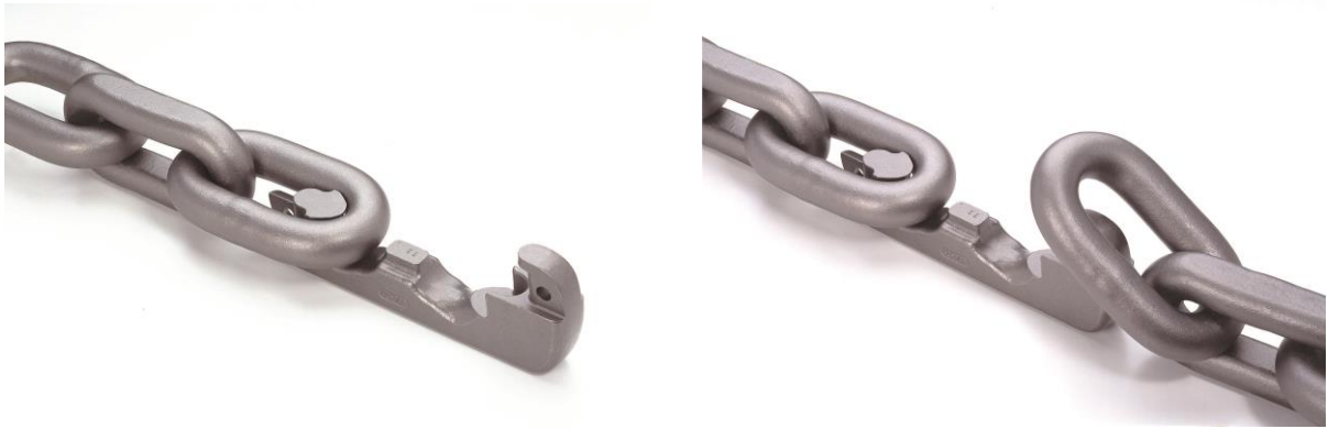
Figures 3 and 4